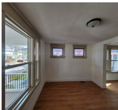
Federal Street A living room in a renovated house as part of the Federal Street and Scattered Sites project