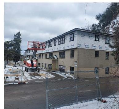
Parliament/Fairfield Building #1 with a new metal roof