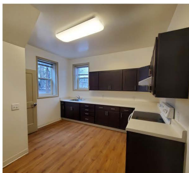
Federal Street A kitchen in a renovated house as part of the Federal Street and Scattered Sites project