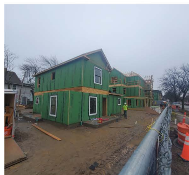
Parliament/Fairfield Renovations of existing buildings in the Parliament/Fairfield project are underway