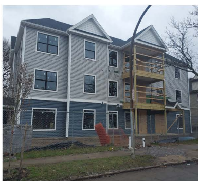
Federal Street Building 25 with siding complete