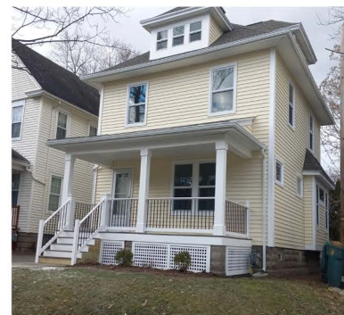
Federal Street An exterior of a recently renovated home